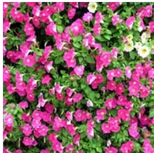
Wave petunias produce a multitude of blossoms.

Wave petunias are low growing petunia plants with compact flower blossoms. The plants reach 6 inches tall but spread up to 48 inches. Pinching back this variety of petunias is not a necessary step in maintaining wave petunias. Old-fashioned petunias need pinching back to encourage blooming, while wave petunias bloom the entire growing season.